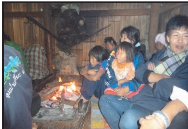
The hill tribe people in Thailand telling stories of how they have benefitted from micro loans.

We help provide revolving loans to poor farmers in impoverished parts of Thailand. Recently I met some of the hill tribe families who previously grew opium or traded elephants or were only labourers but now have their own small business and whose children now go to school. There were great celebrations in one village as they honoured their first University graduate.