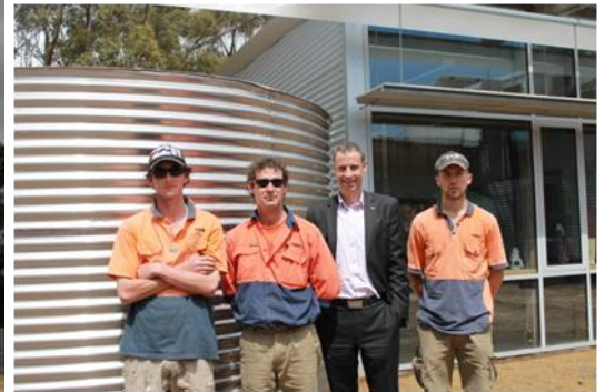
Hon Nick McKim, Minister for Education and Vos employees on site