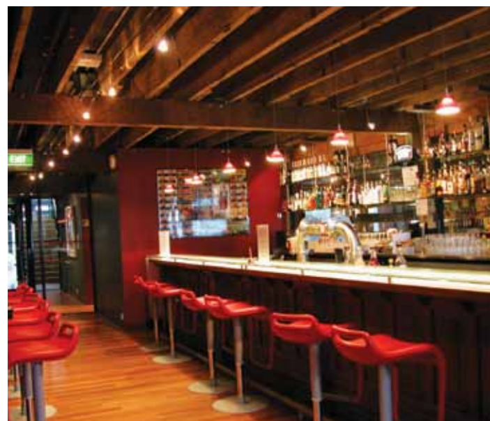
HENRY JONES ART HOTEL Project value $10M