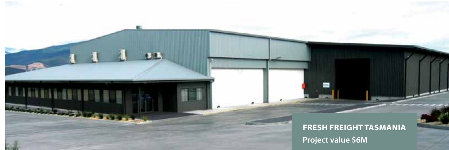
FRESH FREIGHT TASMANIA Project value $6M

OUR CREATIVE TEAM IS EXCEPTIONALLY SKILLED at Design & Construct projects. They worked tirelessly to redesign the Fresh Freight building below to save our client $1.5M. Our team explored all aspects of the project to ensure that the best possible engineering and design is undertaken so as to enable the building to be the most cost effective structure which can be built in the shortest possible time for the client.