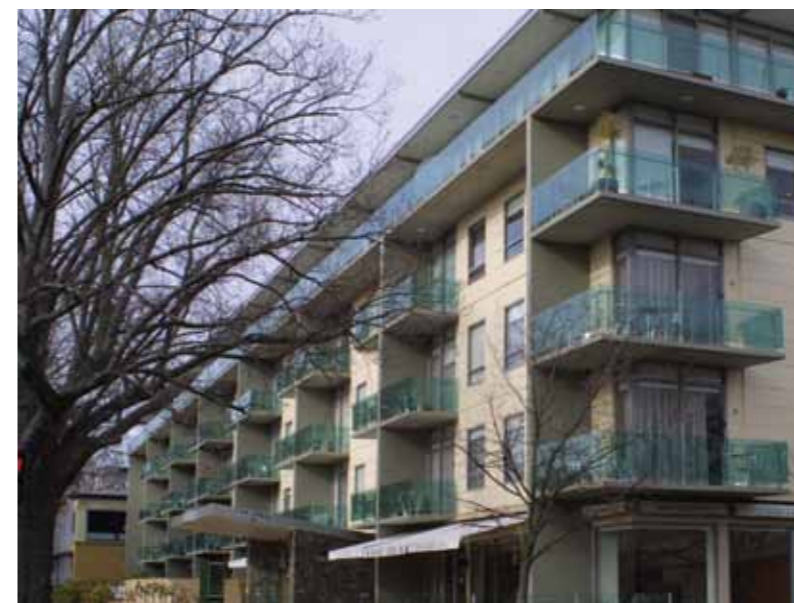
SEBEL HOTEL & APARTMENTS, LAUNCESTON Project value $13M