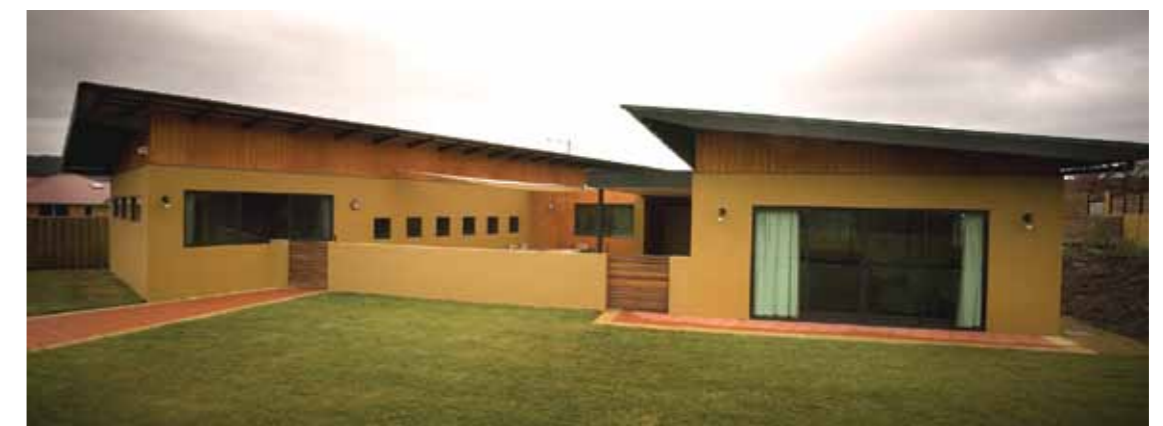
VOS ARE MAJOR SUPPORTERS OF ST GILES and assisted with the funding of both the Respite House in Launceston and the Respite Centre in Kingston