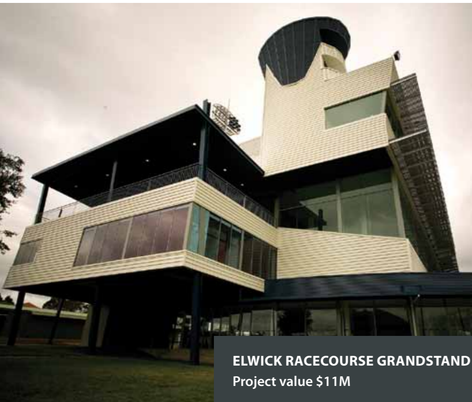
ELWICK RACECOURSE GRANDSTAND Project value $11M