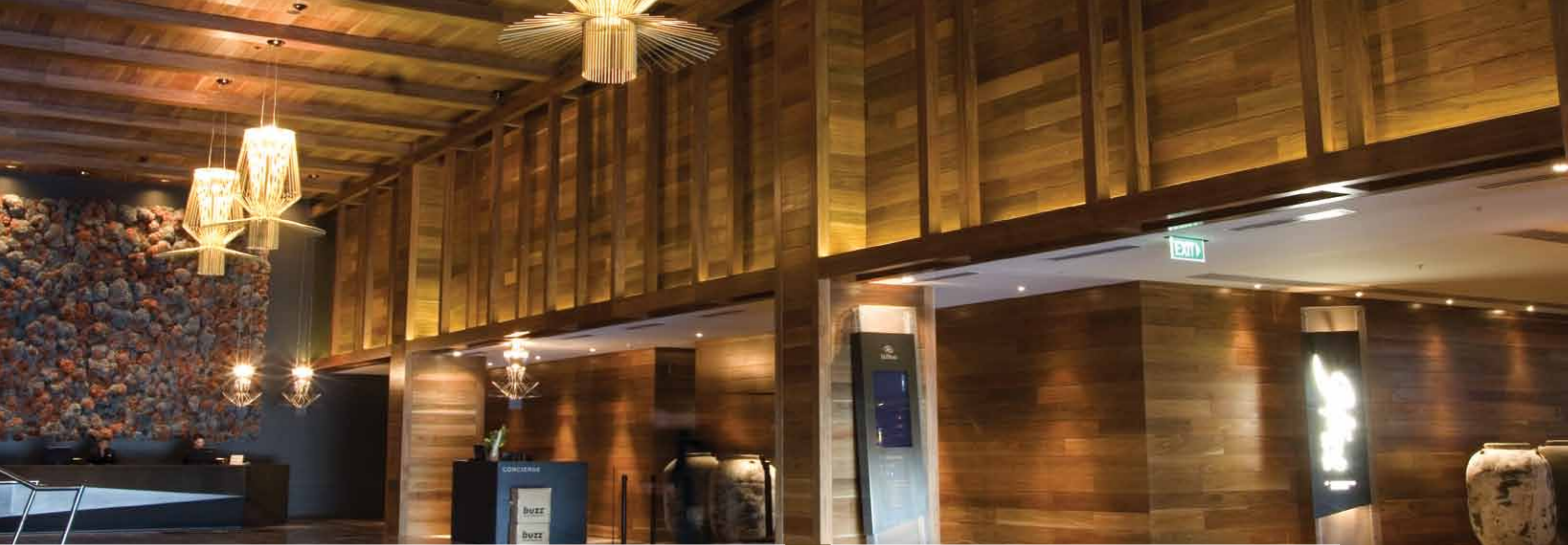
HILTON HOTEL, MELBOURNE Hilton Hotel Lobby - Value $2.2M

Fit-out to Lobby, Bar and Restaurant areas including Reception Counter, elaborate ceiling trusses with integrated lighting and wall panelling.